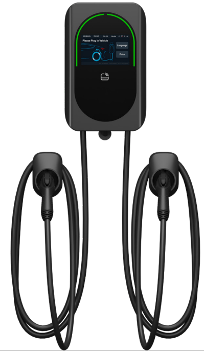
AC Charger (Home)