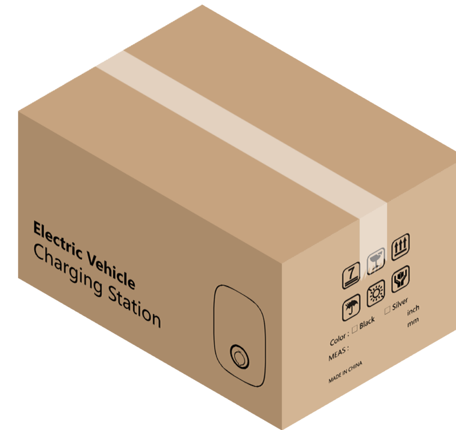
Package Dimensions 19.6" x 13.7" x 9.3"