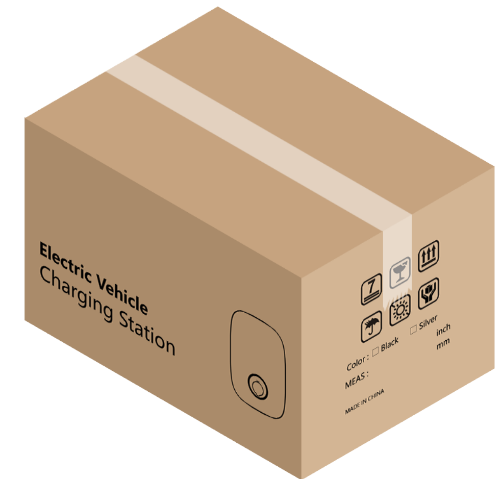
Package Dimensions 19.6" x 13.7" x 10.5"